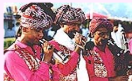
Silk Route Festival Lok Mela Festival Shandur Polo Festival